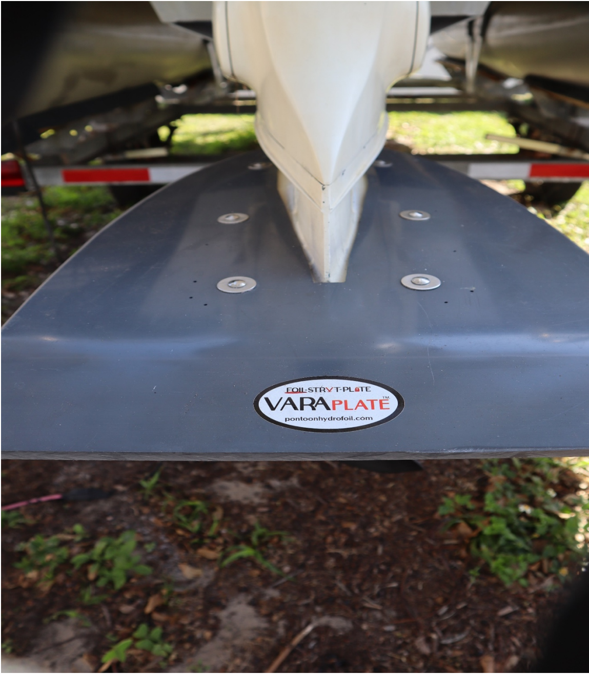
Top View: Note proper bolt alignment and pattern.