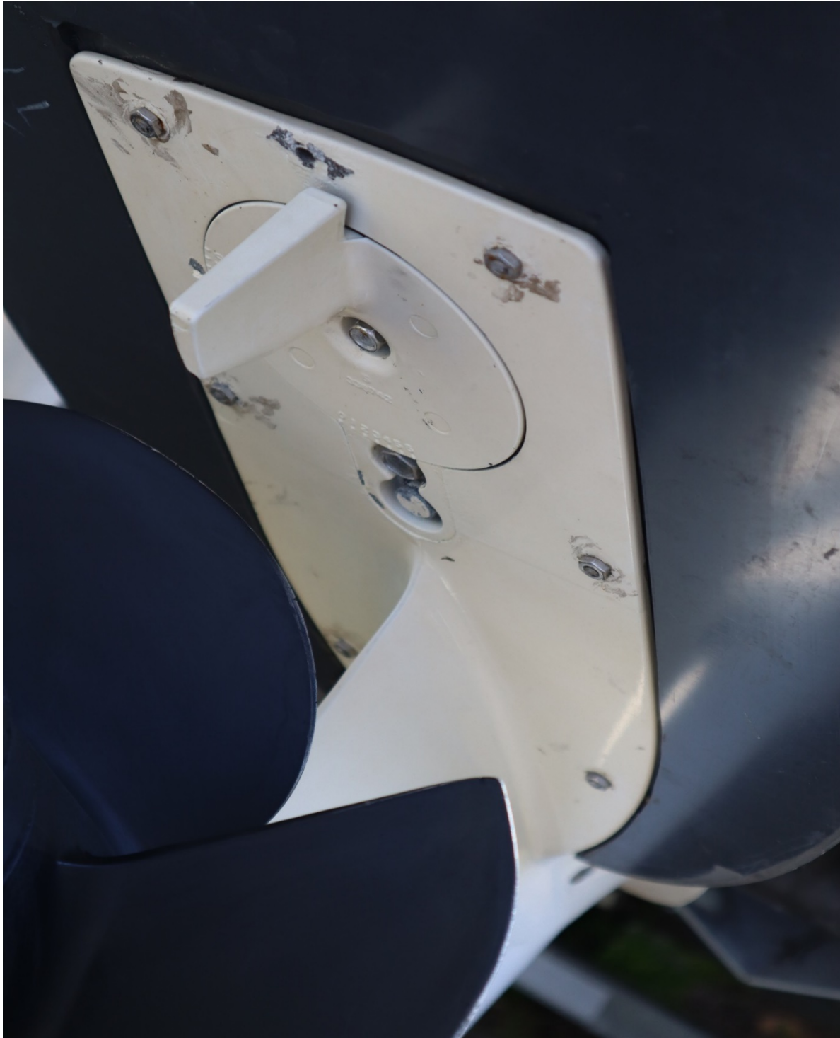
View from Underneath: Note all nuts and bolts are flattened and smooth.